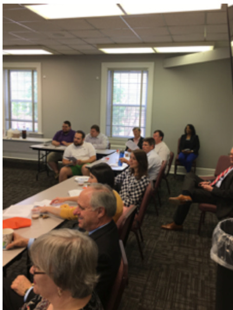
Students, faculty, and staff enjoy the final week of classes by listening to the Immediate Guitar Class' mini sing-a-long.